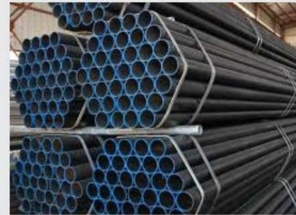
▲ ERW Steel Pipe