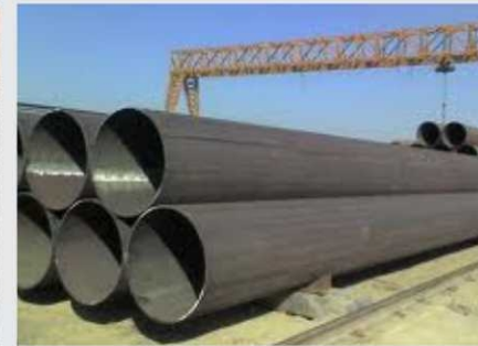
▲ LSAW Steel Pipe