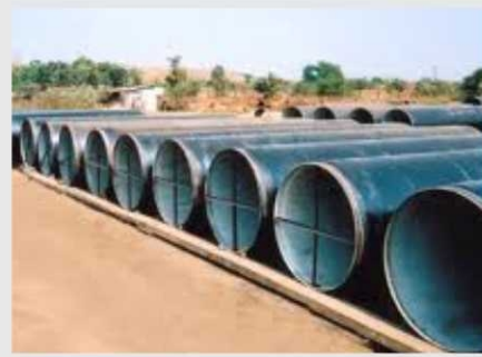
▲ SSAW Steel Pipe