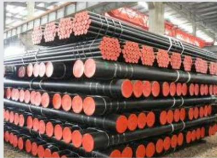
▲ Seamless Steel Pipe